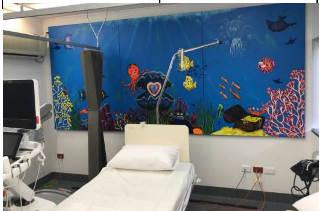
“Heart of the Ocean” mural still sits proudly in the Paediatric Cardio Echo room at MonashHeart May 2020