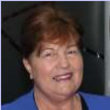
Our President 2019 2020 (Q3)

Moorabbin meets at the Bentleigh RSL 538-540 Centre Road Bentleigh 3204 1st and 3rd Monday Each Month. Fellowship 6:30 pm - 7:00 pm.