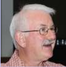
Our President 2020 2021 (Q2)